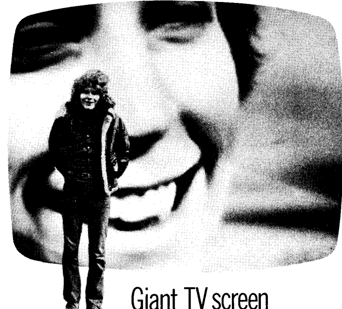
Giant TV screen