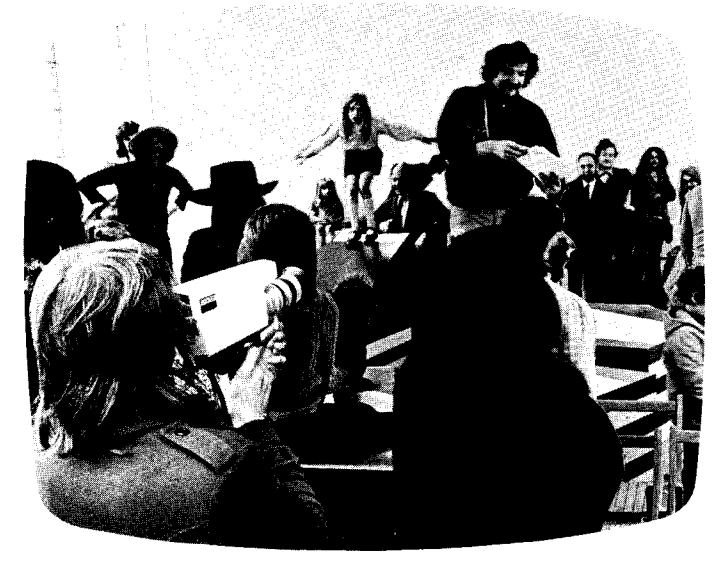
Live events you can take part in