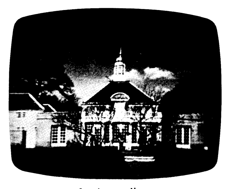
At the gallery in the Park