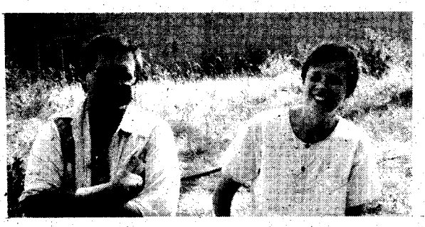
Woody & Steina Vasulka