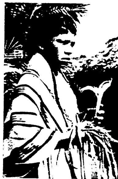
Where the Gods Reign

Each plant has its icaros, so that the repertoire of the shaman apprentice expands as he keeps adding other plants to the basic ayahuasca preparation ( Banisteriopsis caapi + Psychotria viridis ), or when he ingests other plant-teachers that are taken by themselves. The acquisition of magic chants or melodies and the memorization of myths during shamanic initiation seem to be a widely reported phenomenon. I have not yet made a systematic bibliographic survey, but it is possible that the association of the learning of magic chants or melodies with the absorption of the psychotropic plants is quite common. It is found among the Huichol, who ingest peyote ( Lophophora williamsii ) and other psychotropic plants, among the Mazatec,