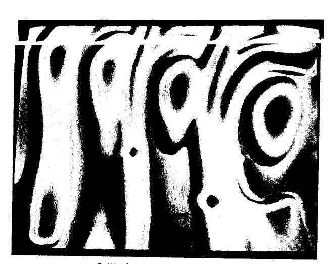
Stills from Walter Wright's performance .

With this machine I haven't been doing that, because it's an open ended machine. For example, yesterday Laddy brought in all this equipment, piled it on the machine, and spent half his day working like an octopus to connect it all up. This machine is open ended. It's virtually impossible for me to develop a notation system for it — I've tried. If I work within a given structure, I can notate — camera angles, levels of pods, color assignments, patching. From there it seemed I could get into compositions. I could get into actually performing in real time with it. That's one of the differences, you know, be-