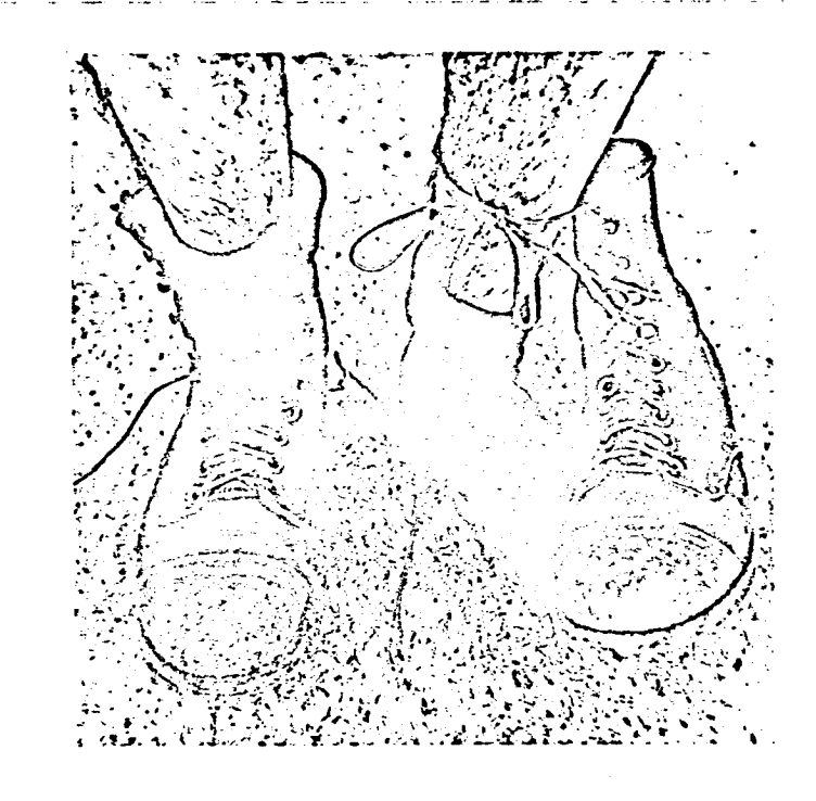
UNTIED ON TIED OFF

The artist's quotations are either from an interview with the author. September 13, 1974, Avalanche, May, 1973, or Interview Magazine, August, 1974.