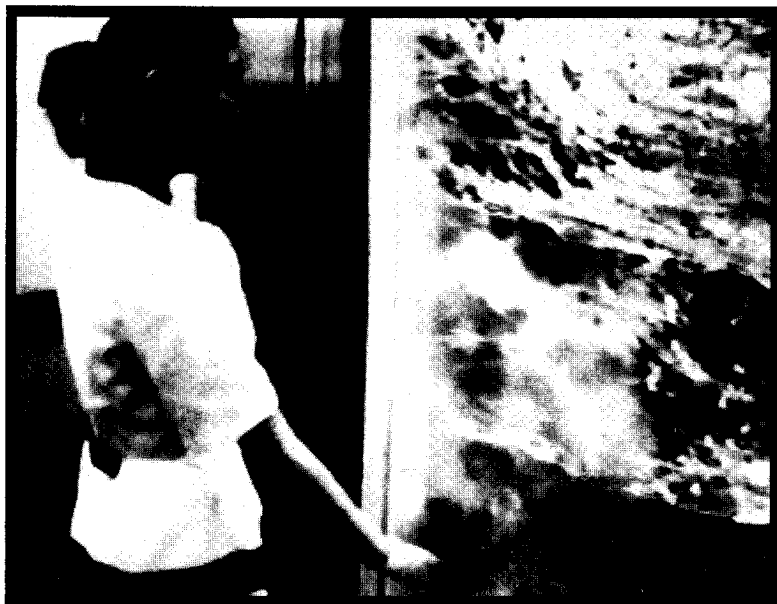
In The Land Of The Elevator Girls 1989 Steina & Woody Vasulka