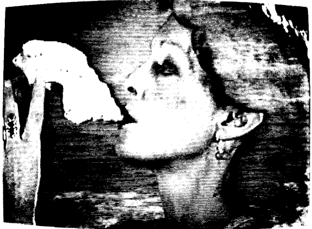
Double Lunar Dogs