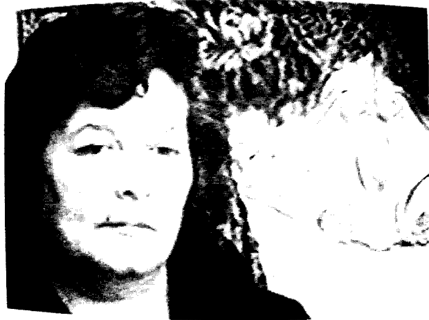
Terra Degli Dea Madre

Abramovic and Ulay travelled to Sicily to continue their project of exploring time and place in relation to a culture and its people. Here, their fluidly moving camera passes through a configuration of rocks and men to an interior of ornate furniture and motionless women, while an evocative hybrid language forms a hypnotic spoken accompaniment. As a study of contrasts — male/female, interior/exterior, nature/civilization — this tape also reveals the affinity of these people with their environment.