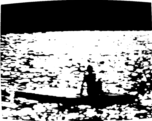
The Water Catalogue