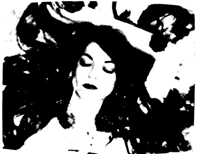
Possibly In Michigan