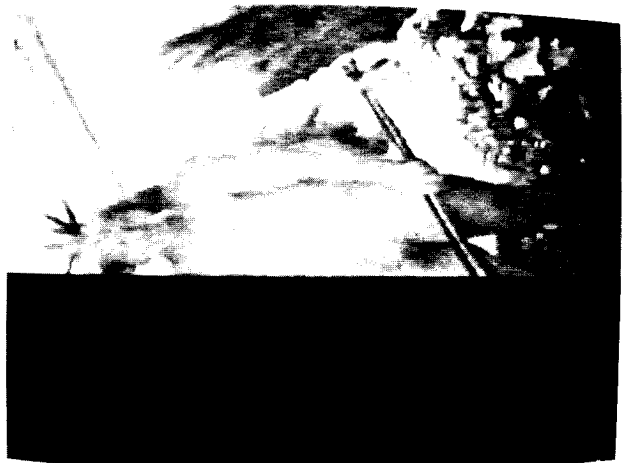
Die Distanz Zwischen Mir Und Meinen Verlusten

In Der Westen Lebt , the erotic play of a man and woman, which suggests a fight for a kiss, is rapidly intercut with the charged repeated image and rhythmic sound of the thrusting pistons of a locomotive. Vom Bruch constructs a tense and powerful study of male/female interaction and antagonism, underscored by Freudian overtones and visual metaphor.