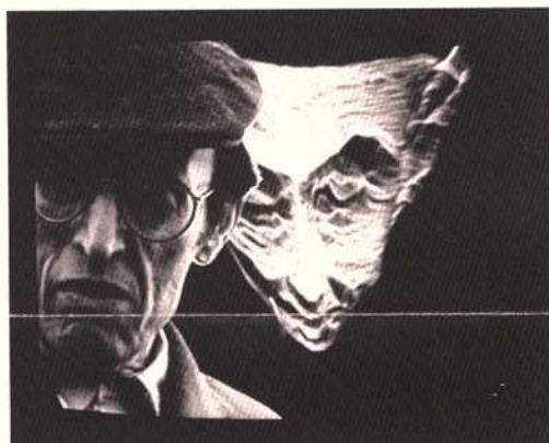
Art of Memory by Woody Vasulka