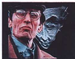
Woody Vasulka (ART OF MEMORY)