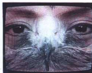
Rob Rombout (ENTRE DEUX TOURS (IN BETWEEN TWO TOWERS))