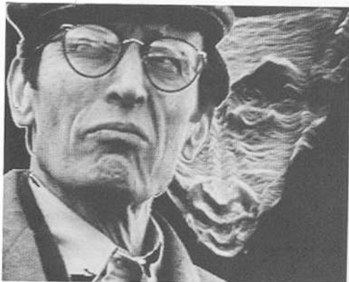
Art of Memory